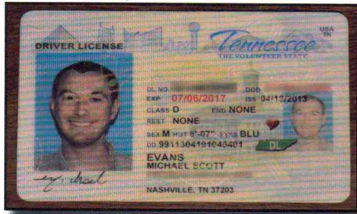
Uruhushya rwo gutwara ibinyabiziga

Igihe ugiye kubonana na muganga, itwaze: